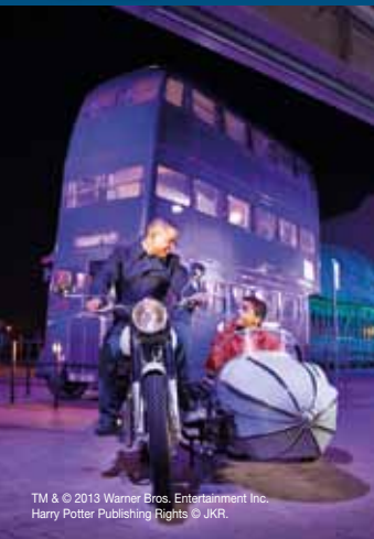
TM & © 2013 Warner Bros. Entertainment Inc. Harry Potter Publishing Rights © JKR.