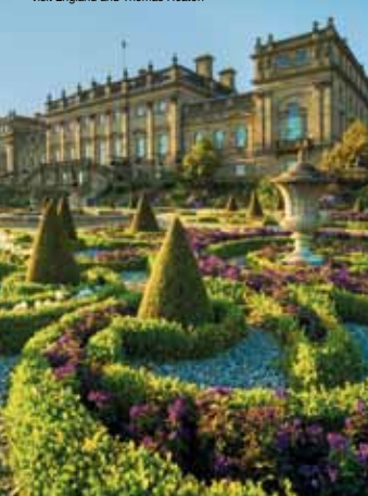
Visit England and Thomas Heaton